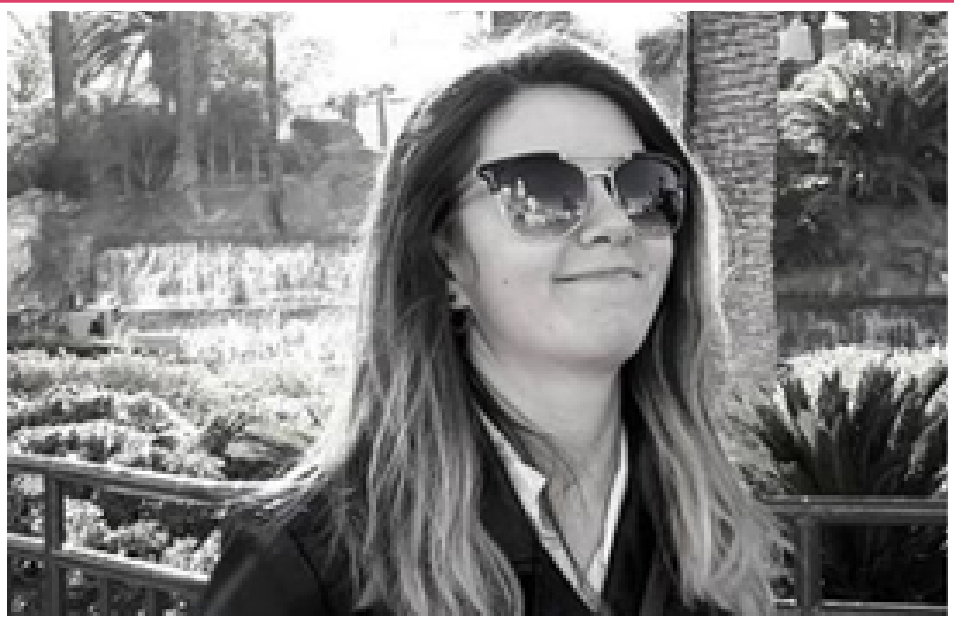
and focus on my recovery.

Since my family lives outside of Canada, I chose not to tell them until a year after my diagnosis. My husband and some true friends were there for me when I needed them. They ran errands for me, cooked, and sent care packages so I could relax